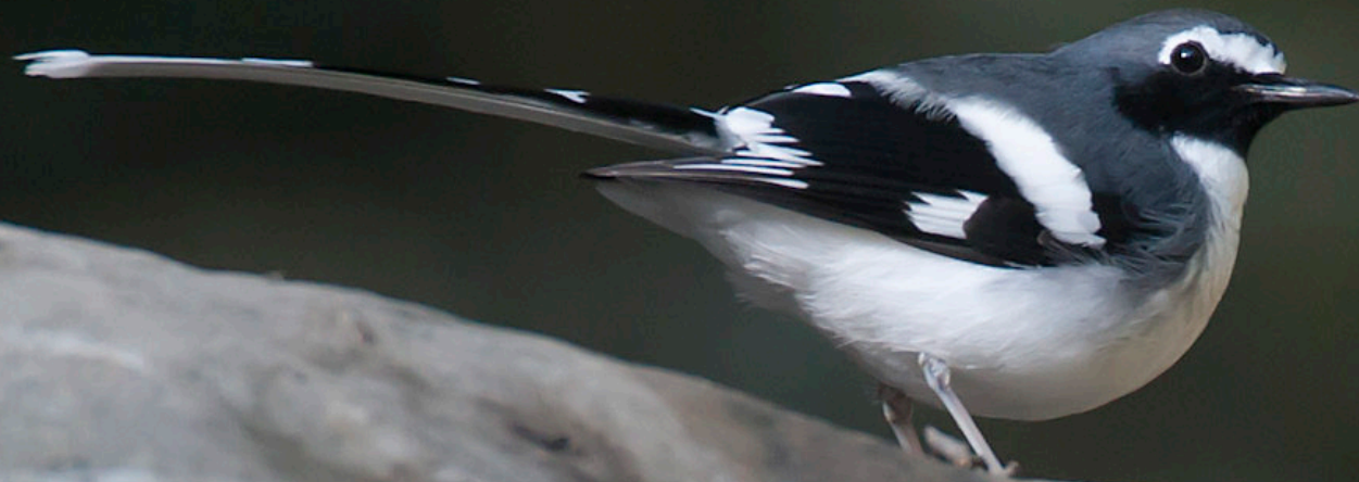
Spotted Fork tail ( Enicurus maculatus )