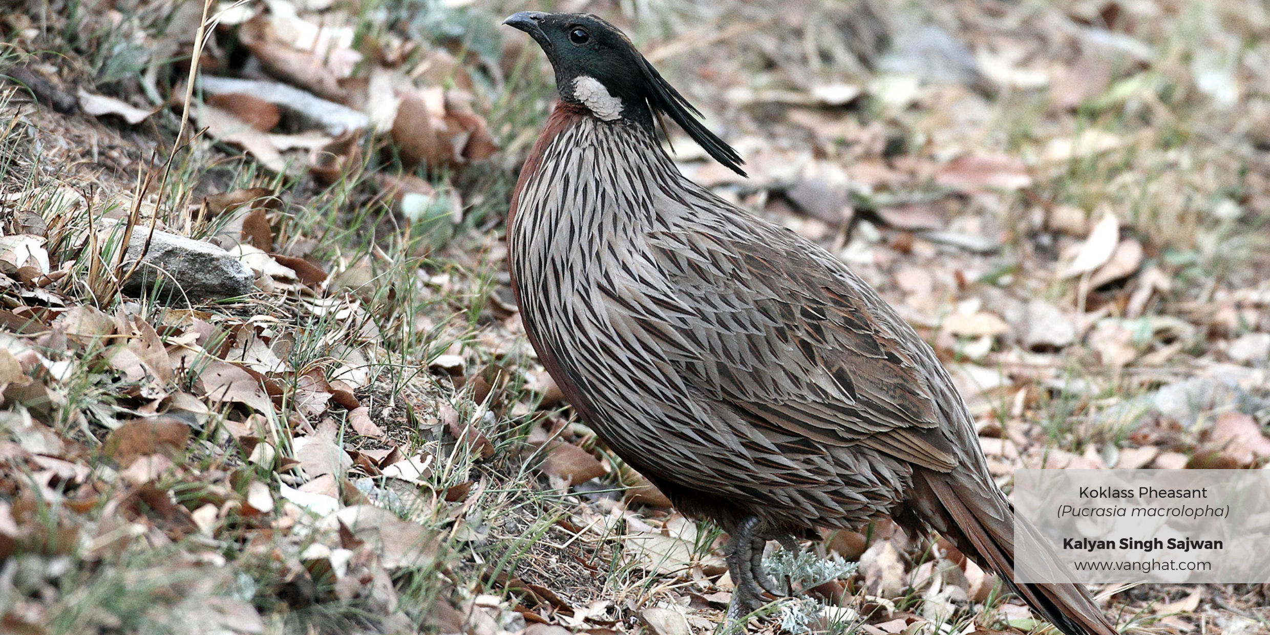
Koklass Pheasant ( Pucrasia macrolopha )