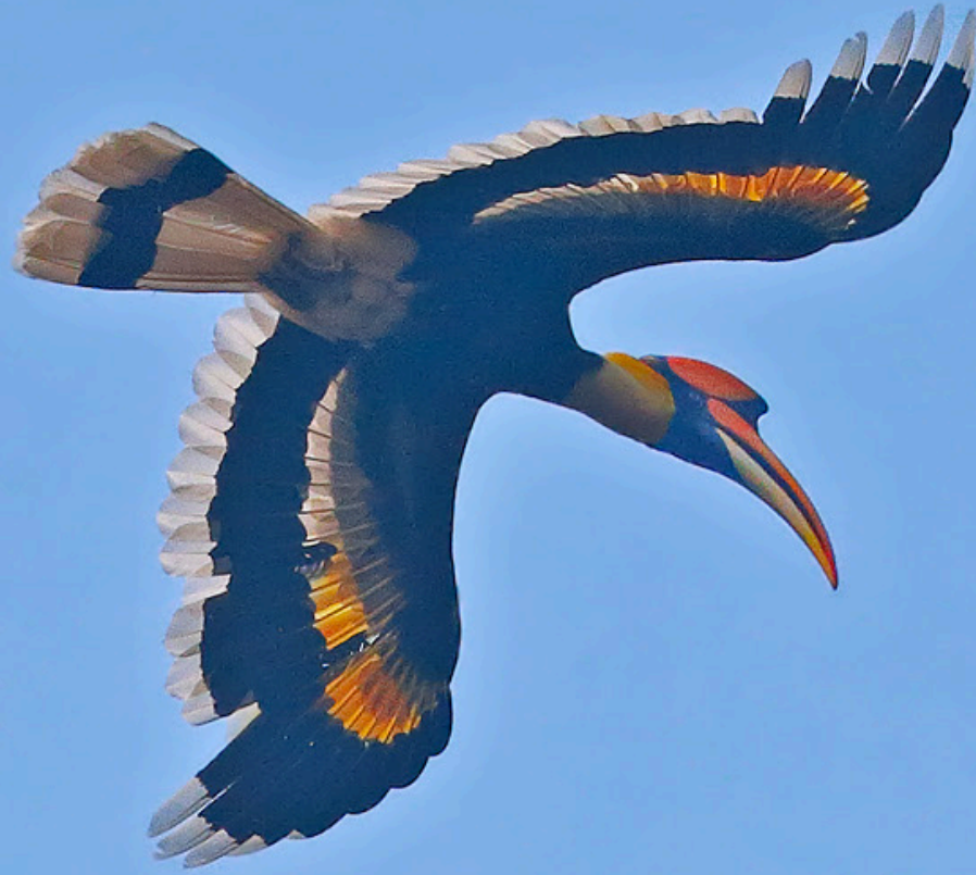
Great Hornbill ( Buceros bicornis )