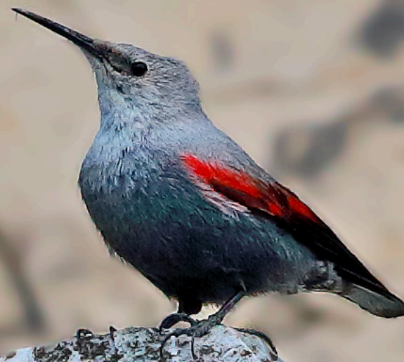
Wallcreeper ( Tichodroma muraria )

Birding tour at Corbett, Vanghat and Hills of Sattal & Pangot guided by experienced naturalists.